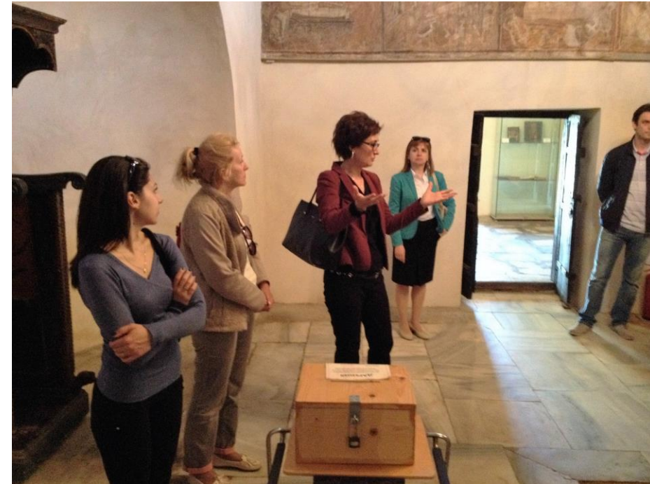
CC meeting, Burgas, May 2016: St. Anastasia Island