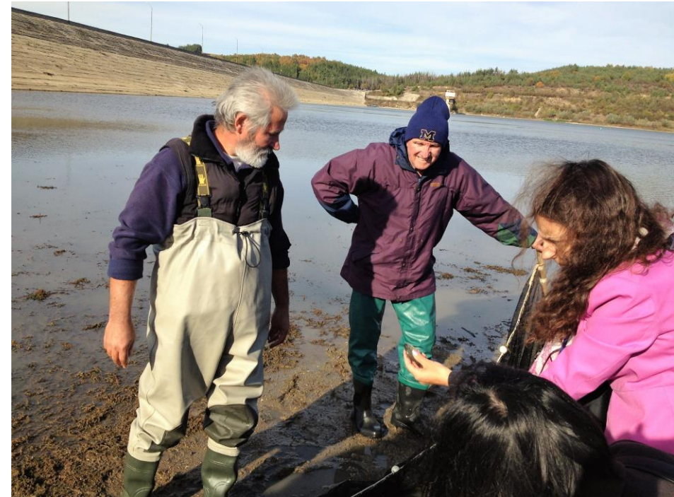
EEA Conference in Sofia, October 2016: The excursion on alien invasive species