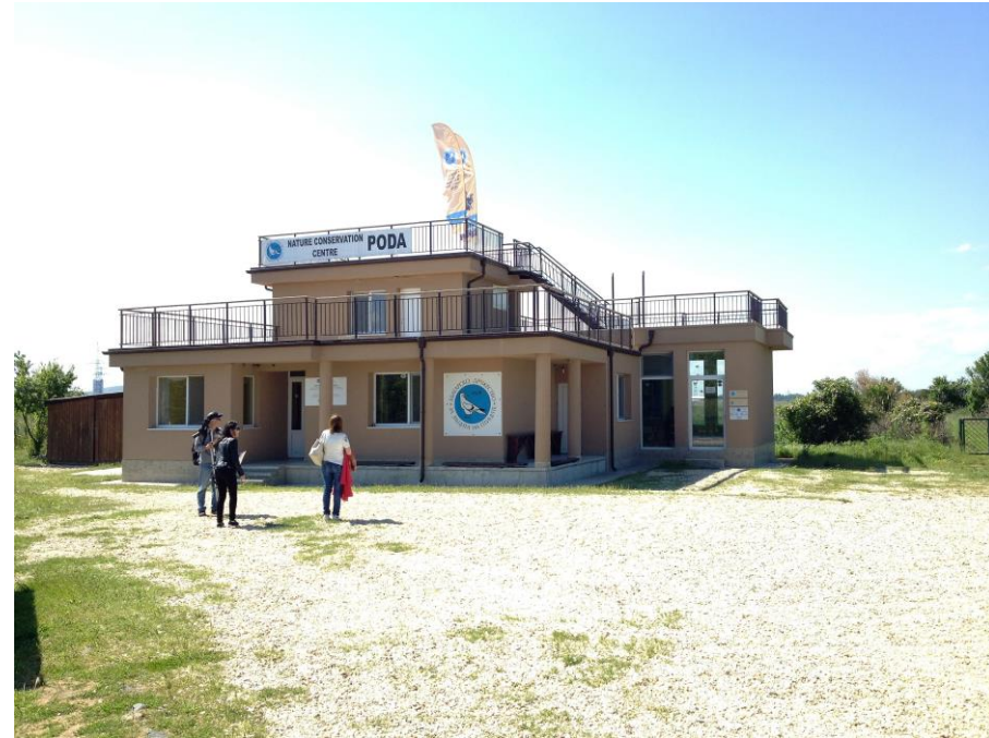
CC meeting, Burgas, May 2016: Poda Conservation Centre