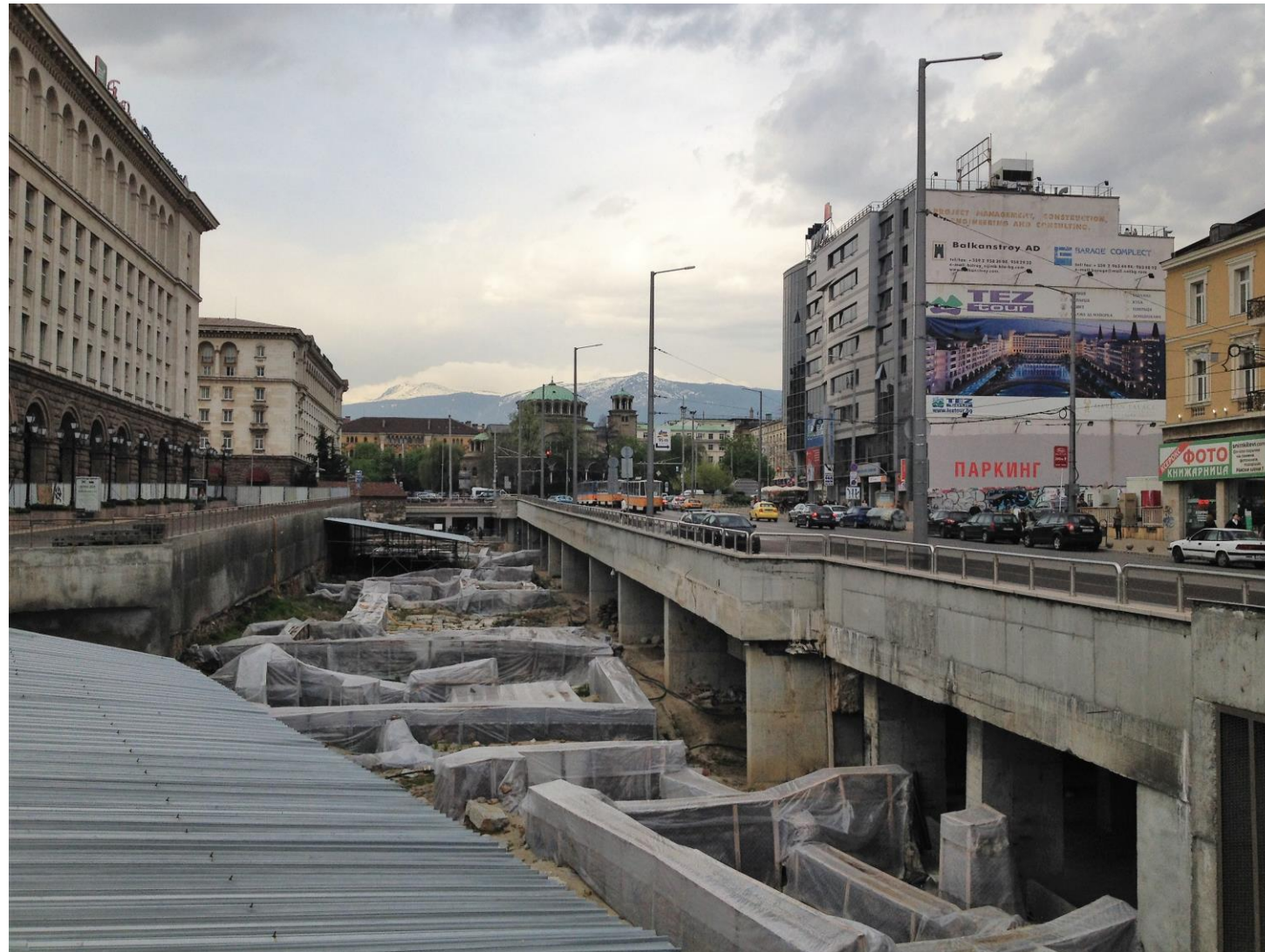
SC meeting, Sofia, April 2015