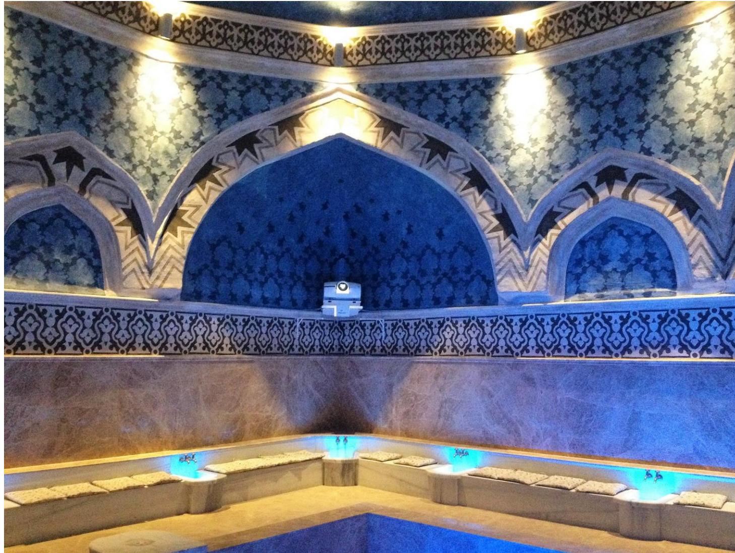
CC Meeting, Burgas, May 2016: Imperial Turkish Bath, Aqua Calidae (Thermopolis)